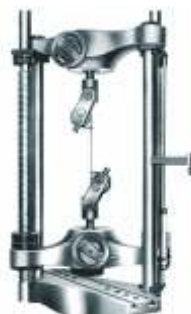
Attachment for Tension Test of - Wire Ropes (Min. Ø1 to Ø10mm)