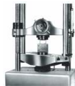
Shear Test (Min. Ø5 to Ø20mm) & (Min.Ø25 to Ø40mm)