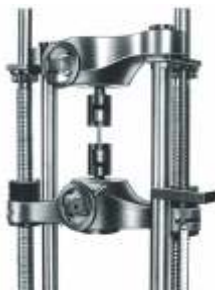
Attachment for Tension Test of - Shouldered & Threaded specimens upto M6 to M20 (Min. length 110 mm).