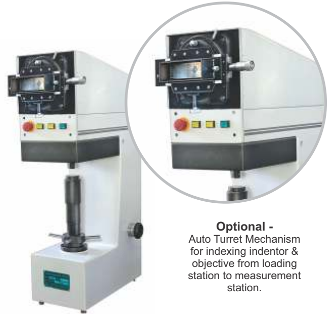
Optional - Auto Turret Mechanism for indexing indenter & objective from loading station to measurement station.

For Auto Turret Machine after clicking on cycle start button indexing mechanism will operate automatically & loading mechanism starts, once loading finishes again indexing mechanism will positioned at measuring station.