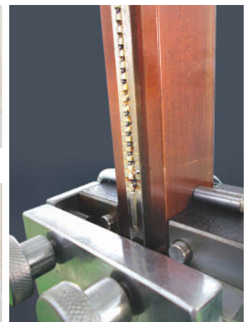
Close view of Broach

Due to constant Research & Development, Specifications and Features are subject to change without notice.