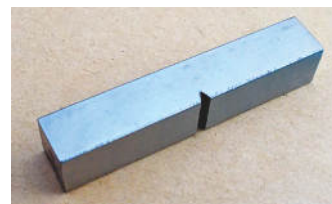
"V" Notch Sample Specimen

Machine comes with either "V" or "U" Notch Broach. It depends on customers requirement.